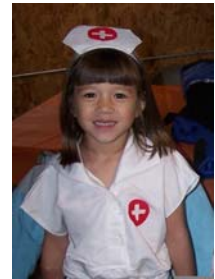
Lots of kids aspire to one day become doctors & nurses

Dear Doctors at the Penobscot Valley Hospital,